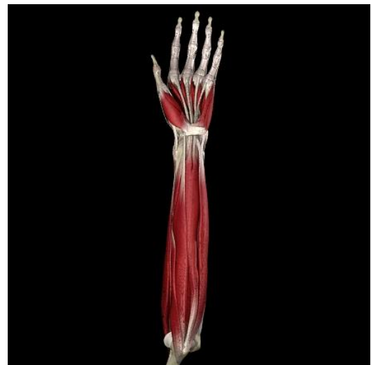
Interactive Hand 2000

As was previously mentioned, all of these muscles attach up at the elbow. If you were to stand with the arm straight at your side and the palm facing forward, you will be able to feel a bony prominence at the elbow on the side closest to the body. This is called the medial epicondyle . The muscles on the front of the forearm are collectively called the flexor muscles. Although there are many different muscles and many different layers of muscles, the vast majority of these muscles attach to this medial epicondyle through what is known as the common flexor tendon. There is a similar situation on the back of the forearm as well. The muscles on the back of the arm are known as the extensor muscles. The various extensor muscles attach to the lateral epicondyle , which is the body prominence on the outside of the elbow opposite the medial epicondyle.