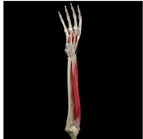
Interactive Hand 2000

The hand is a very complicated area and as such there are a very large number of muscles that are associated with the hand and wrist. The majority of these muscles, especially the stronger muscles, actually run all the way from the hand, up the forearm and attach at the elbow. You can easily test this yourself by squeezing your forearm and firmly opening and closing your hand. You will feel the muscles in the forearm contract and relax as you open and close the hand. It is important to realize that even though it is a small area, there are many different muscles that attach at the elbow and travel down to the hand. These muscles are arranged in layers, and each muscle within each layer has a different job, or function. For example some of the muscles in the most superficial layer that is the layer right under the skin, travel down and attach to the wrist. When they contract they act to flex and extend the wrist. Some of the muscles in the middle and deeper layers attach all the way into the fingers and when they contract they move the fingers, such as when making a fist or picking up objects. These deeper muscles that move the fingers have many separate tendons that go to each individual finger. This makes it possible to move one finger by itself, and enables us to carry out tasks requiring fine motor skills such as typing, buttoning a shirt, or playing the guitar.