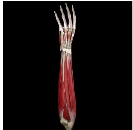
Interactive Hand 2000