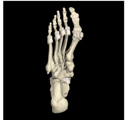
Interactive Foot and Ankle 2

It is important to realize that beneath the plantar fascia the muscles are arranged in layers, and each muscle within each layer has a different job or function. For example, some of the muscles attach all the way into the toes and act to flex and stabilize the toes, while other muscles attach into the other bones of the mid-foot to control and stabilize the arch of the foot. For the foot and ankle to work properly, and to prevent pain and injury, not only does there have to be adequate strength and flexibility of the foot and calf muscles, but these different layers of muscles need to be able to glide freely over one another during normal use.