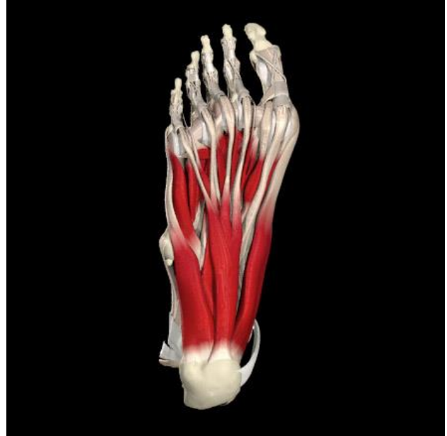
Interactive Foot and Ankle 2

As the muscles and fascia of the foot become strained and develop adhesions, they become very tight. As the tightness increases, the tissues begin to pull away from the heel where they attach, the repetitive strain injury cycle