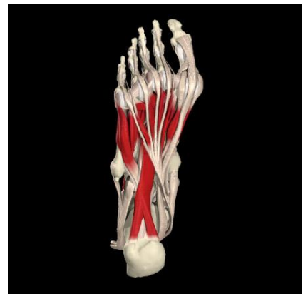
Interactive Foot and Ankle 2 © 2001 Primal Pictures Ltd